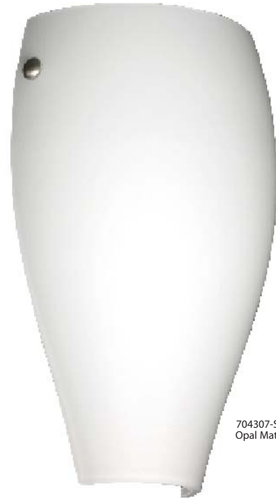
704307-SN Opal Matte

UL or ETL Listed. Suitable for Damp Locations (interior use only).