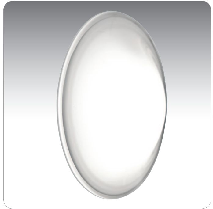
LUMA SHOWN IN OPAL GLOSSY/CLEAR

UL or ETL Listed. Suitable for Damp Locations (interior use only).