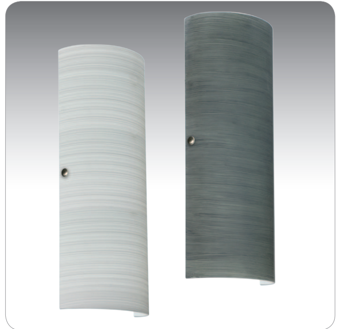
TORRE 18 SHOWN IN CHALK (8193KR) & TITAN (8193TN)