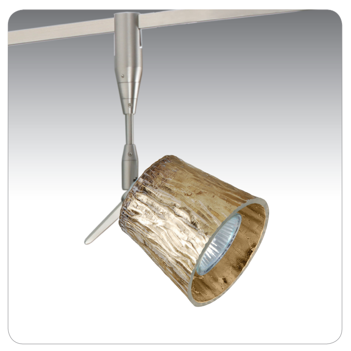
STONE GOLD FOIL SHOWN WITH LED AND ON MONORAIL

UL or ETL Listed. Suitable for Dry Locations (interior use only).