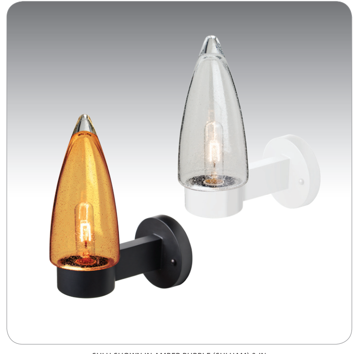
SULU SHOWN IN AMBER BUBBLE (SULUAM) & IN CLEAR BUBBLE (SULUCL)