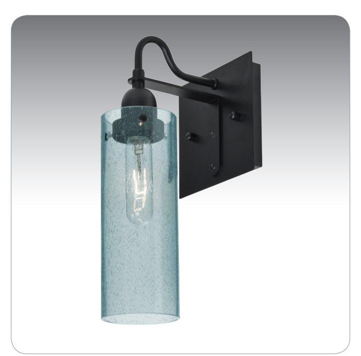
BLUE BUBBLE (JUNI10BL)