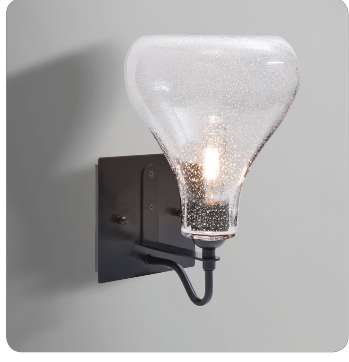
MELOCL (CLEAR BUBBLE)