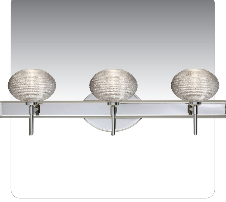
LASSO SHOWN IN GLITTER (5612GL) IN CHROME FINISH

UL or ETL Listed. Suitable for Damp Locations (interior use only).