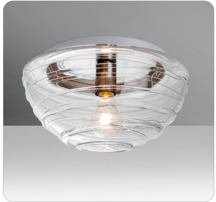
WAVE 12 CEILING SHOWN IN CLEAR (906261C)

UL or ETL Listed. Suitable for Damp Locations (interior use only).