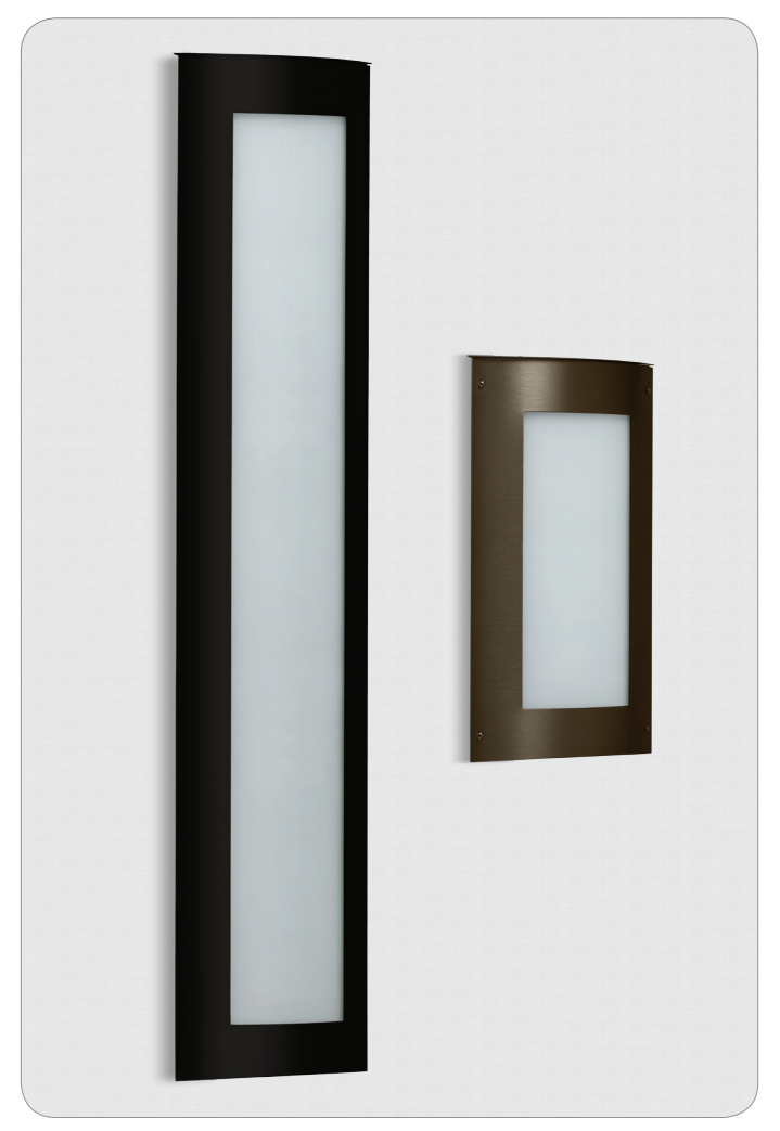
EXPO38-WA-LED-BK (BLACK) & EXPO16-WA-LED-BR (BRONZE)