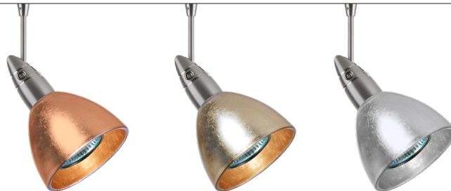
1758SF SILVER FOIL