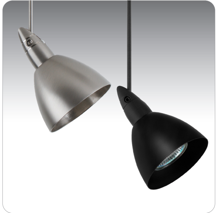
DIVI IN METAL NICKEL & METAL BLACK

UL or ETL Listed. Suitable for Dry Locations (interior use only).