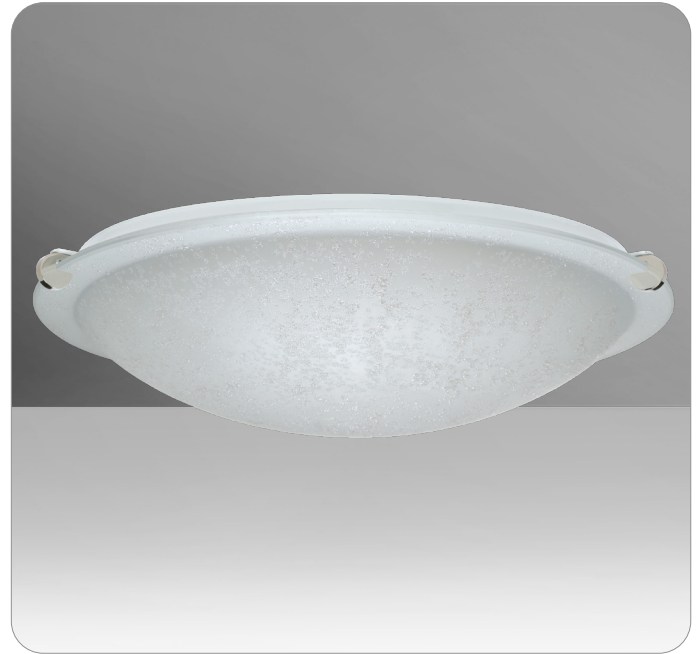
TRIO CEILING SHOWN IN STUCCO

UL or ETL Listed. Suitable for Damp Locations (interior use only).