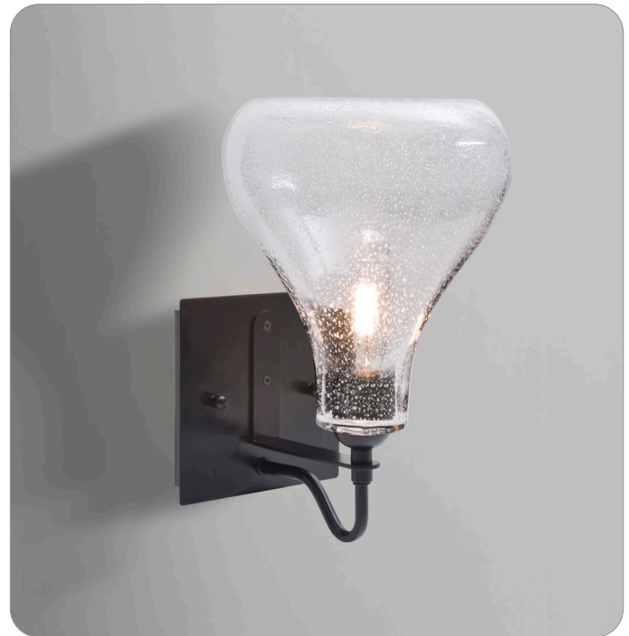
MELOCL (CLEAR BUBBLE)

UL or ETL Listed. Suitable for Damp Locations (interior use only).