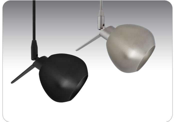
MOJO IN BLACK & SATIN NICKEL W/ LED OPTION

UL or ETL Listed. Suitable for Dry Locations (interior use only).