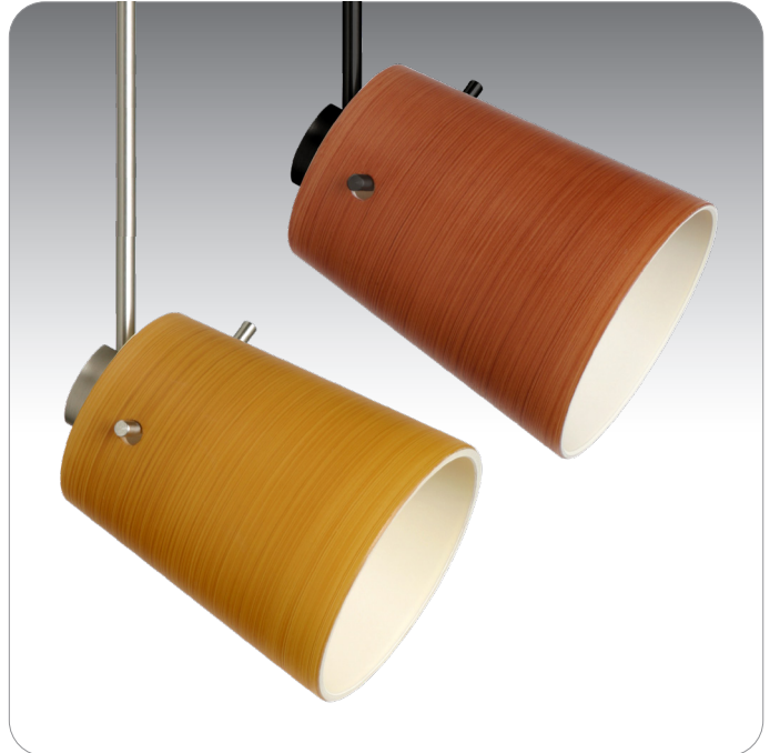
TAMMI 3 IN OAK & CHERRY

UL or ETL Listed. Suitable for Dry Locations (interior use only).