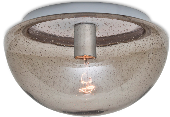
8490SMC Smoke Bubble

UL wet location when used under a covered ceiling.