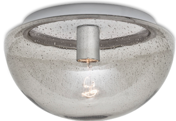
8490CLC Clear Bubble