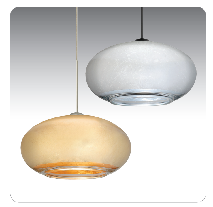
BRIO 7 SHOWN IN GOLD FOIL (2492GF) & SILVER FOIL (2492SF) WITH BLACK FINISH