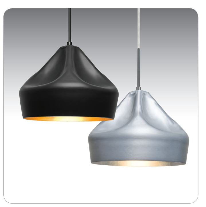
BLACK W/ CHAMPAGNE REFLECTOR & SATIN NICKEL W/ SILVER REFLECTOR

All dimensions provided are nominal. Allowance must be made for dimensional tolerance in handcrafted glasses.