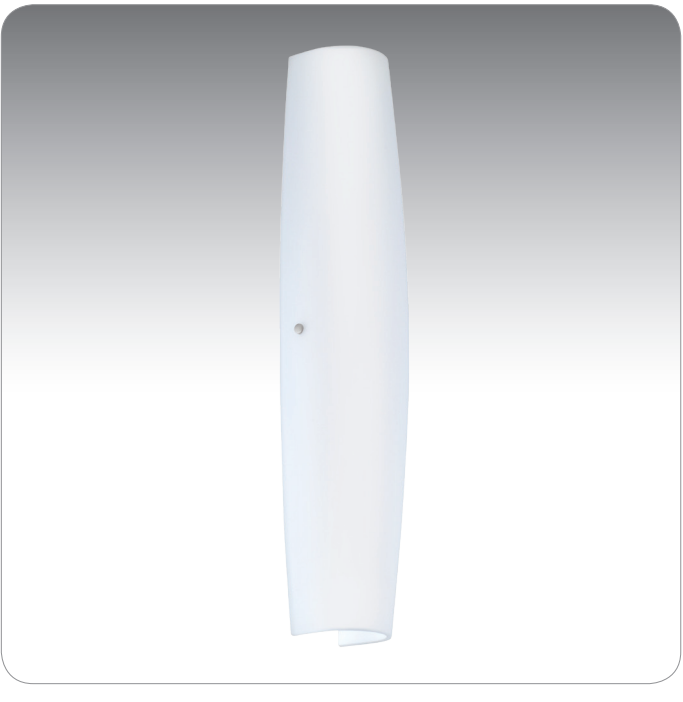
MISTRAL SHOWN IN OPAL MATTE (711207)