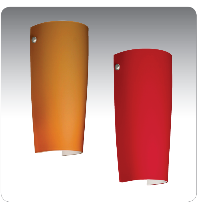
TOMAS SHOWN IN AMBER MATTE (704180) & RUBY MATTE (7041RM)

UL or ETL Listed. Suitable for Damp Locations (interior use only).