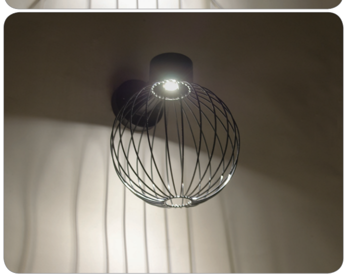
TOP TO BOTTOM: SULTANA C, F, G

All dimensions provided are nominal. Allowance must be made for dimensional tolerance in handcrafted glasses.