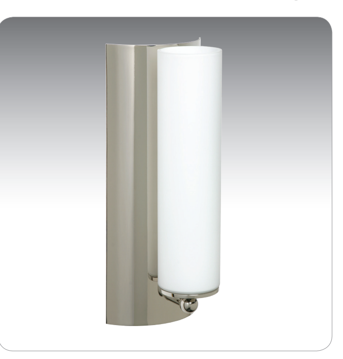
METRO SHOWN IN OPAL MATTE, POLISHED NICKEL (1WE-118607-PN)

UL or ETL Listed. Suitable for Damp Locations (interior use only).