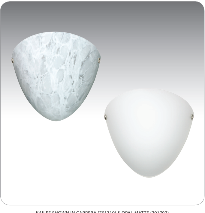
KAILEE SHOWN IN CARRERA (701719) & OPAL MATTE (701707)