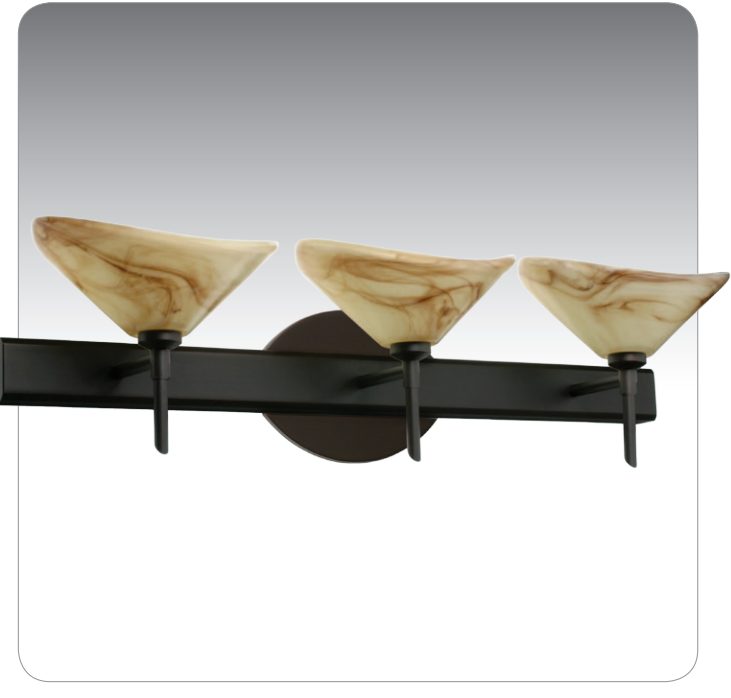
HOPPI SHOWN IN MOCHA (191383) IN BRONZE FINISH

UL or ETL Listed. Suitable for Damp Locations (interior use only).