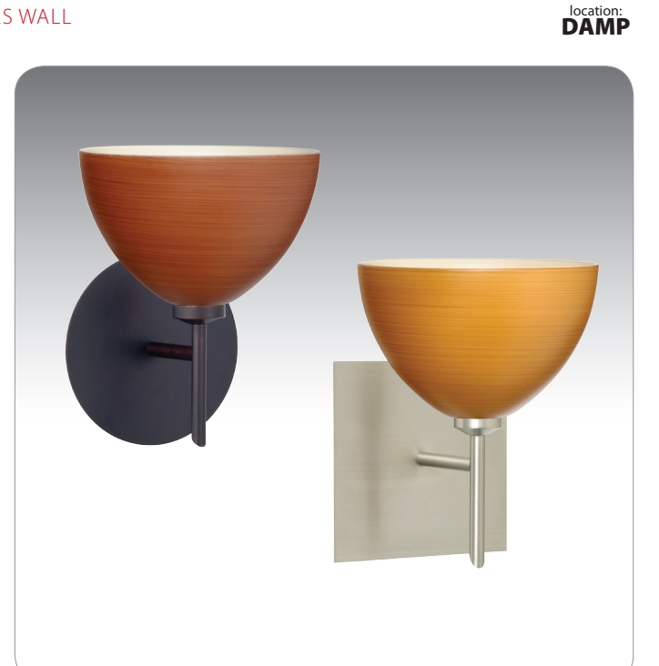
BRELLA SHOWN IN CHERRY (4679CH) IN BRONZE FINISH & OAK (4679OK) WITH SQUARE CANOPY