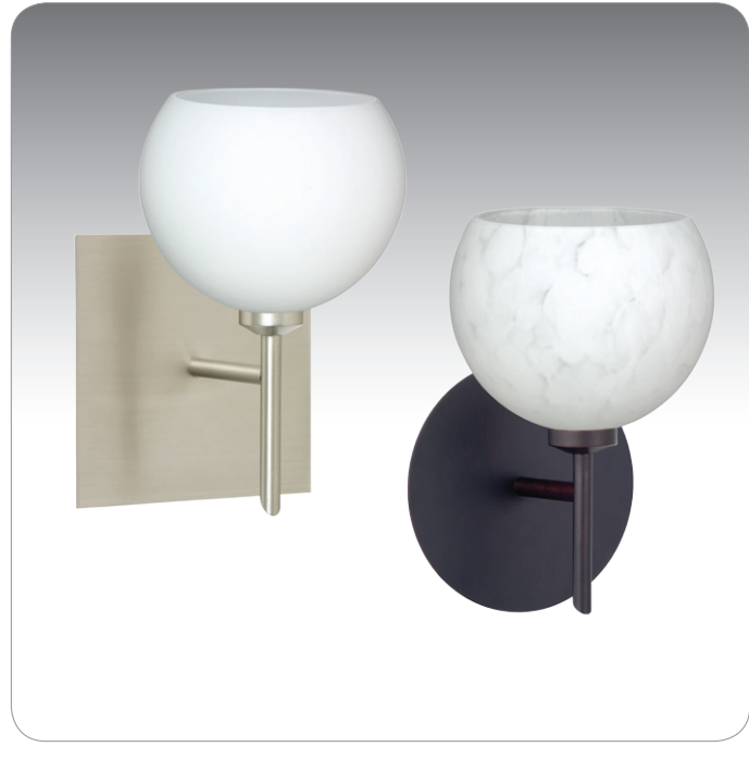
PALLA 5 SHOWN IN OPAL MATTE (565807) WITH SQUARE CANOPY & CARRERA (565819) IN BRONZE FINISH