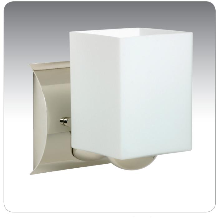
RISE SHOWN IN OPAL MATTE (449807)