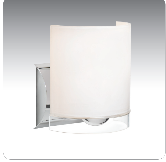
CELTIC SHOWN IN OPAL GLOSSY/CLEAR (CELTICCL) IN CHROME FINISH

UL or ETL Listed. Suitable for Damp Locations (interior use only).