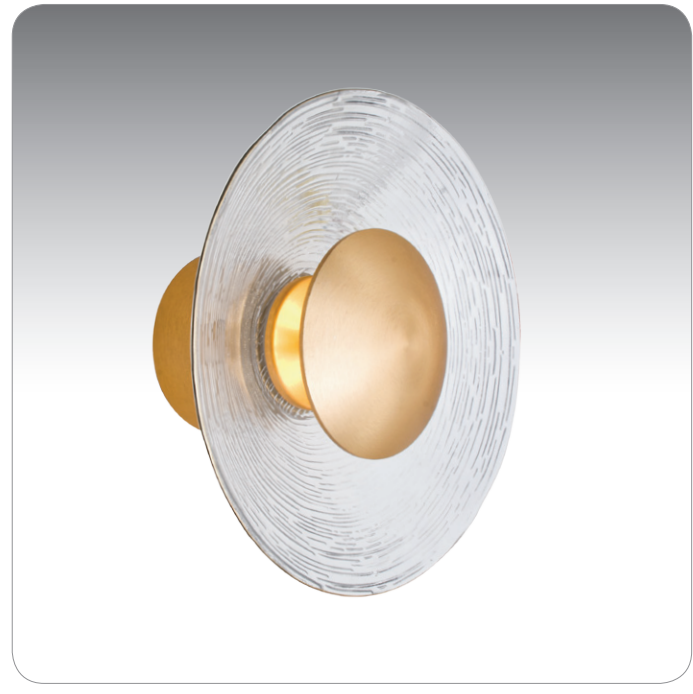
BRUSHED BRASS/CLEAR (SLYBB)