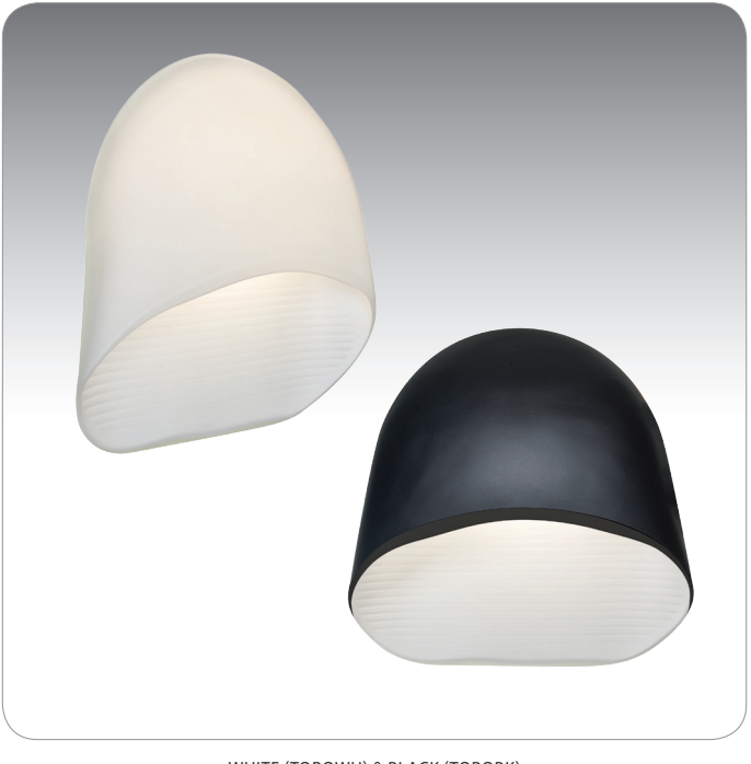
WHITE (TOROWH) & BLACK (TOROBK)