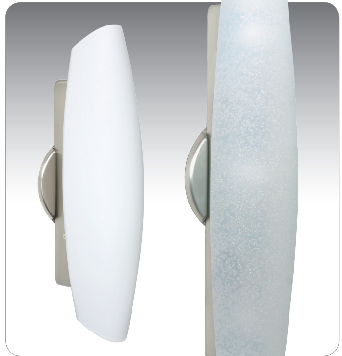
AERO 16 SHOWN IN OPAL MATTE (272807) & AERO 21 SHOWN IN STUCCO (27295T)

UL or ETL Listed. Suitable for Damp Locations (interior use only).