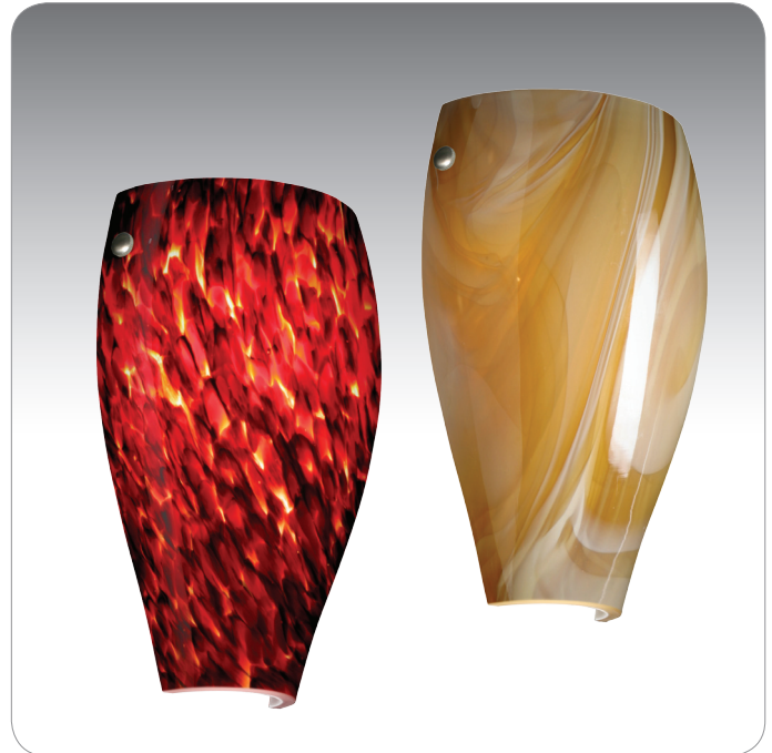
CHELSEA SHOWN IN GARNET (704341) & HONEY (7043HN)

UL or ETL Listed. Suitable for Damp Locations (interior use only).