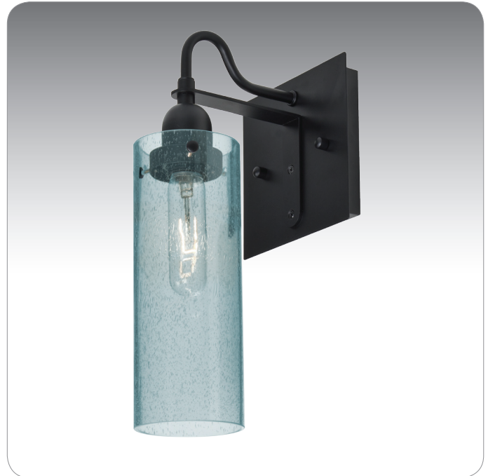
BLUE BUBBLE (JUNI10BL)

UL or ETL Listed. Suitable for Damp Locations (interior use only).