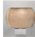
2WF: 14" L