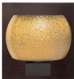
KENOWH WHITE SAND