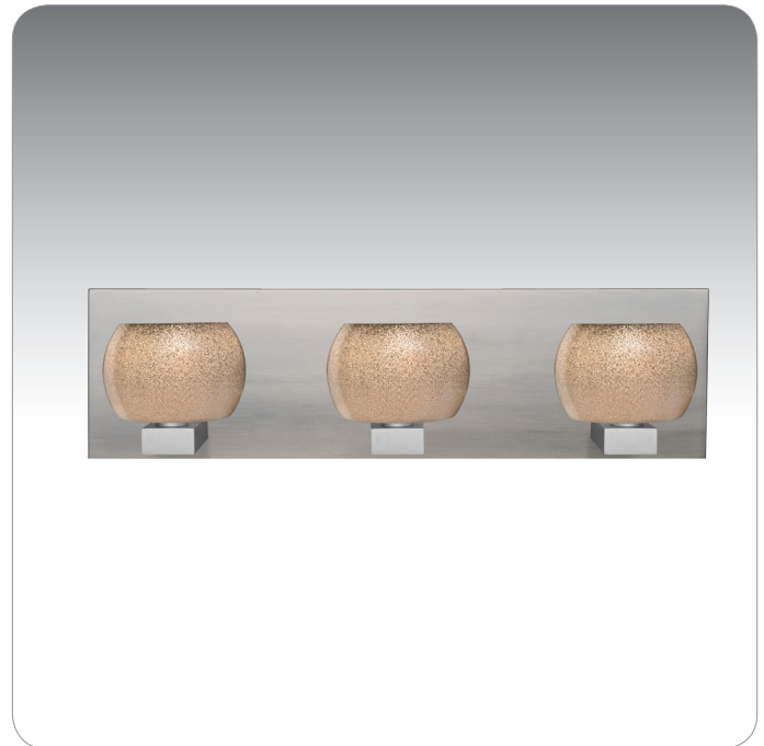
SMOKE SAND (KENOSM)

UL or ETL Listed. Suitable for Damp Locations (interior use only).