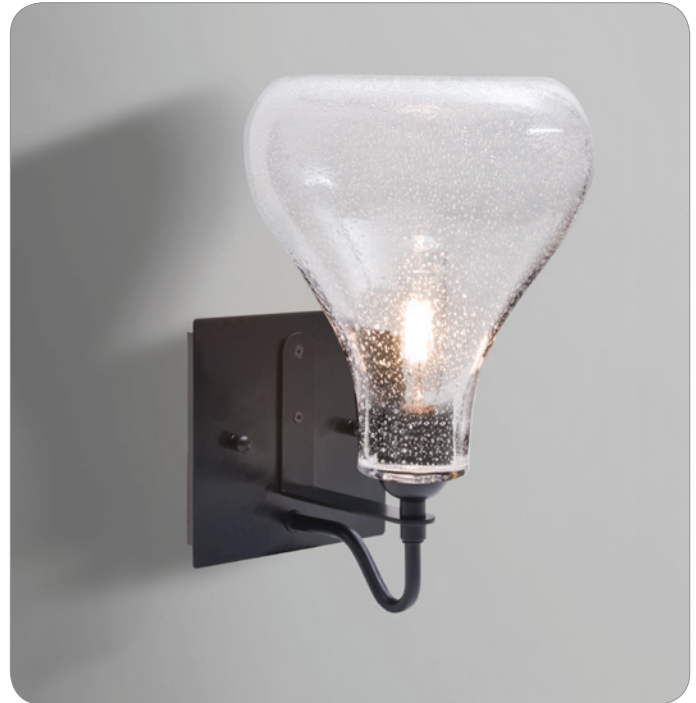
MELOCL (CLEAR BUBBLE)

UL or ETL Listed. Suitable for Damp Locations (interior use only).