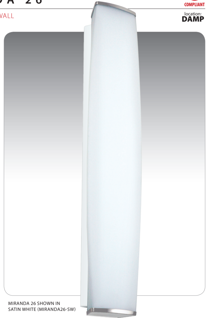
MIRANDA 26 SHOWN IN SATIN WHITE (MIRANDA26-SW)