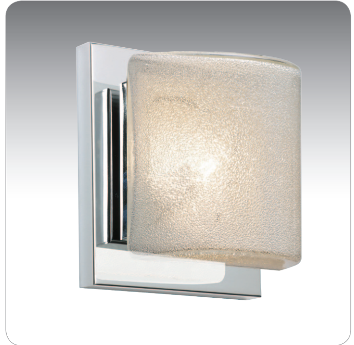
PAOLO SHOWN IN GLITTER (7873GL) IN CHROME FINISH