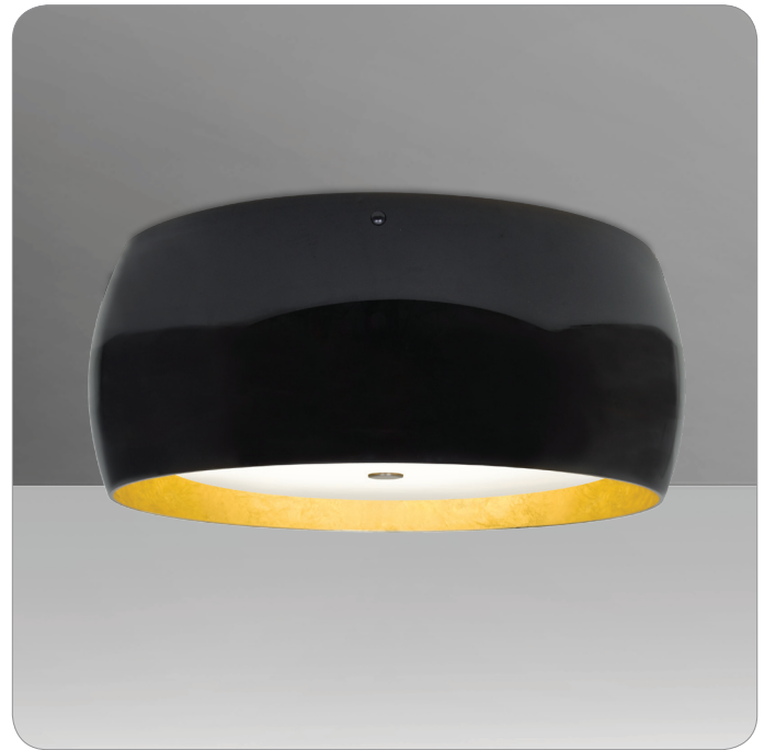
BLACK/INNER GOLD FOIL (POGOGF)

UL or ETL Listed. Suitable for Damp Locations (interior use only).