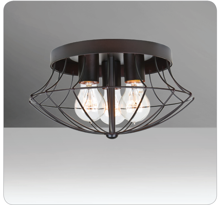
SPEZZA 13 CEILING SHOWN IN BRONZE (SPEZZA13C-BR) WITH EDISON LAMPS

UL or ETL Listed. Suitable for Damp Locations (interior use only).