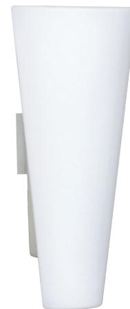
OPAL MATTE 780407