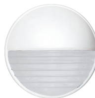
301953-FR White with Frost option