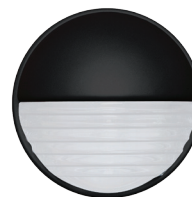
301957-FR Black with Frost option