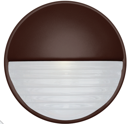
301998-FR Bronze with Frost option