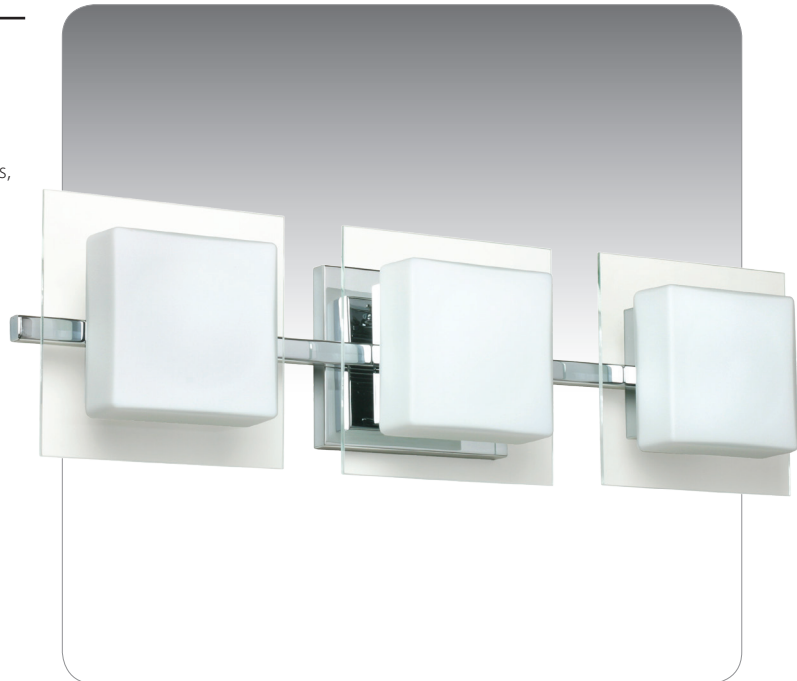
ALEX SHOWN IN CLEAR/OPAL (773539) IN CHROME FINISH

UL or ETL Listed. Suitable for Damp Locations (interior use only).