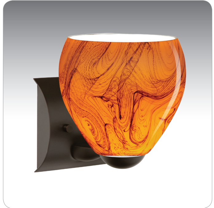
BOLLA SHOWN IN HABANERO FINISH (4122HB) IN BRONZE FINISH

UL or ETL Listed. Suitable for Damp Locations (interior use only).