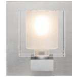
2WF: 14" L