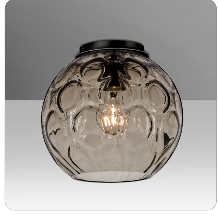
BOMBAY CEILING SHOWN IN SMOKE (BOMBAYSMC)