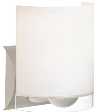
CELTICCL OPAL GLOSSY/CLEAR