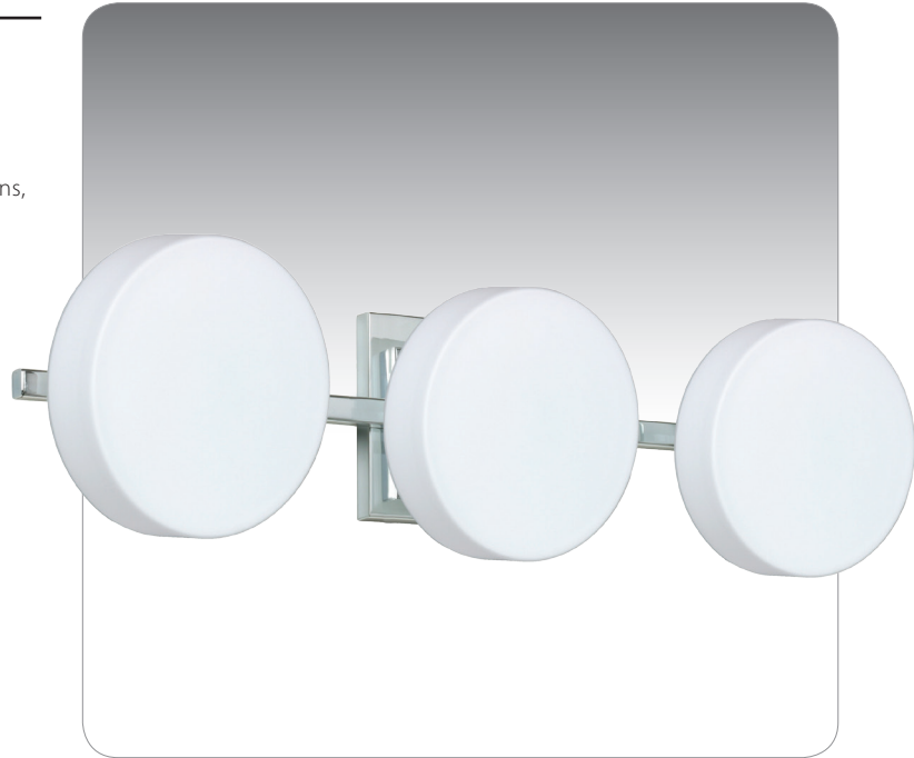
CIRO SHOWN IN OPAL MATTE (773807) IN CHROME FINISH

UL or ETL Listed. Suitable for Damp Locations (interior use only).