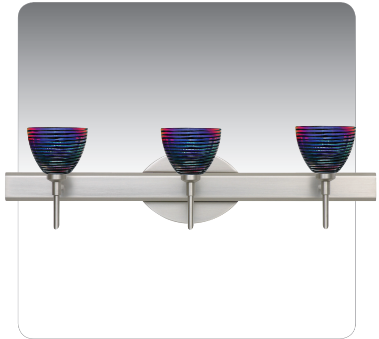
DIVI SHOWN IN SILVER DICRO WAVY (1858SW)

UL or ETL Listed. Suitable for Damp Locations (interior use only).