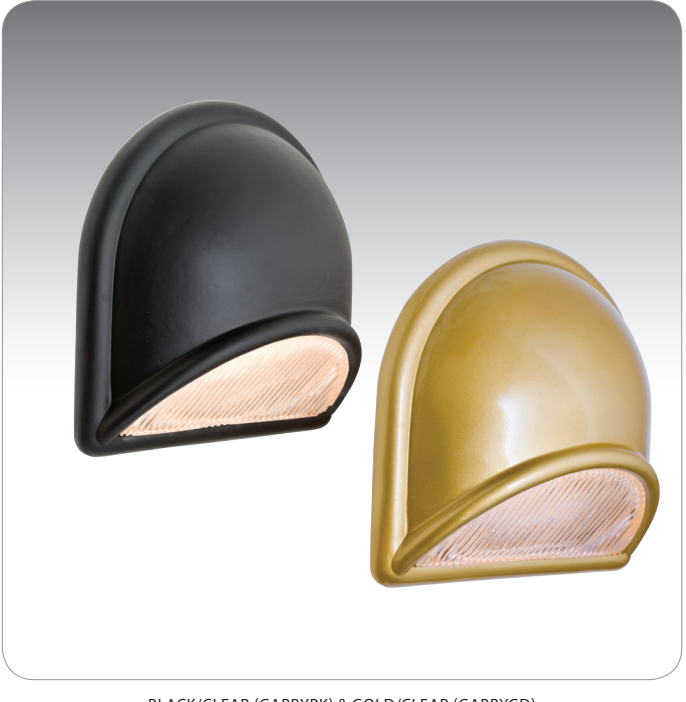
BLACK/CLEAR (GABBYBK) & GOLD/CLEAR (GABBYGD)