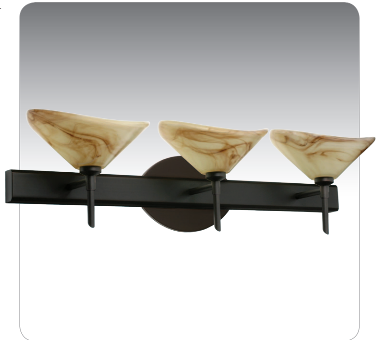
HOPPI SHOWN IN MOCHA (191383) IN BRONZE FINISH

UL or ETL Listed. Suitable for Damp Locations (interior use only).